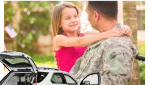
Scooter lifts, turning seats, and driving accessories