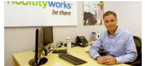
Certified Mobility Consultants Provide Comprehensive Needs Analysis

MobilityWorks is committed to serving you. Contact us today so we can evaluate your needs and find a solution that best fits your lifestyle.