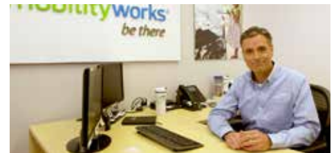
Certified Mobility Consultants Provide Comprehensive Needs Analysis

MobilityWorks is committed to serving you. Contact us today so we can evaluate your needs and find a solution that best fits your lifestyle.